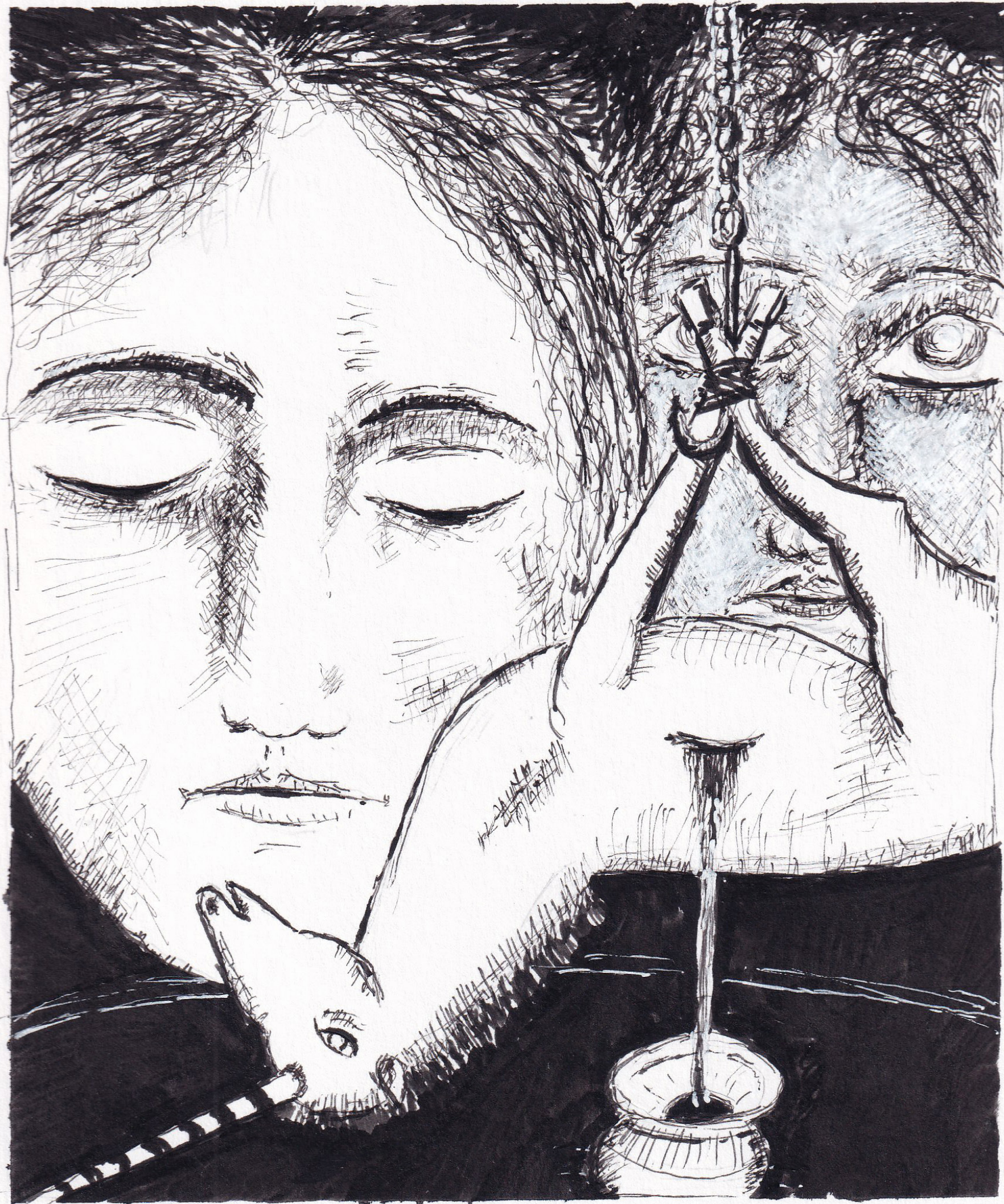
No.1225-B Captured Unicorn 2025 Ink on Bristol 9 × 12 in (22.9 × 30.5 cm)