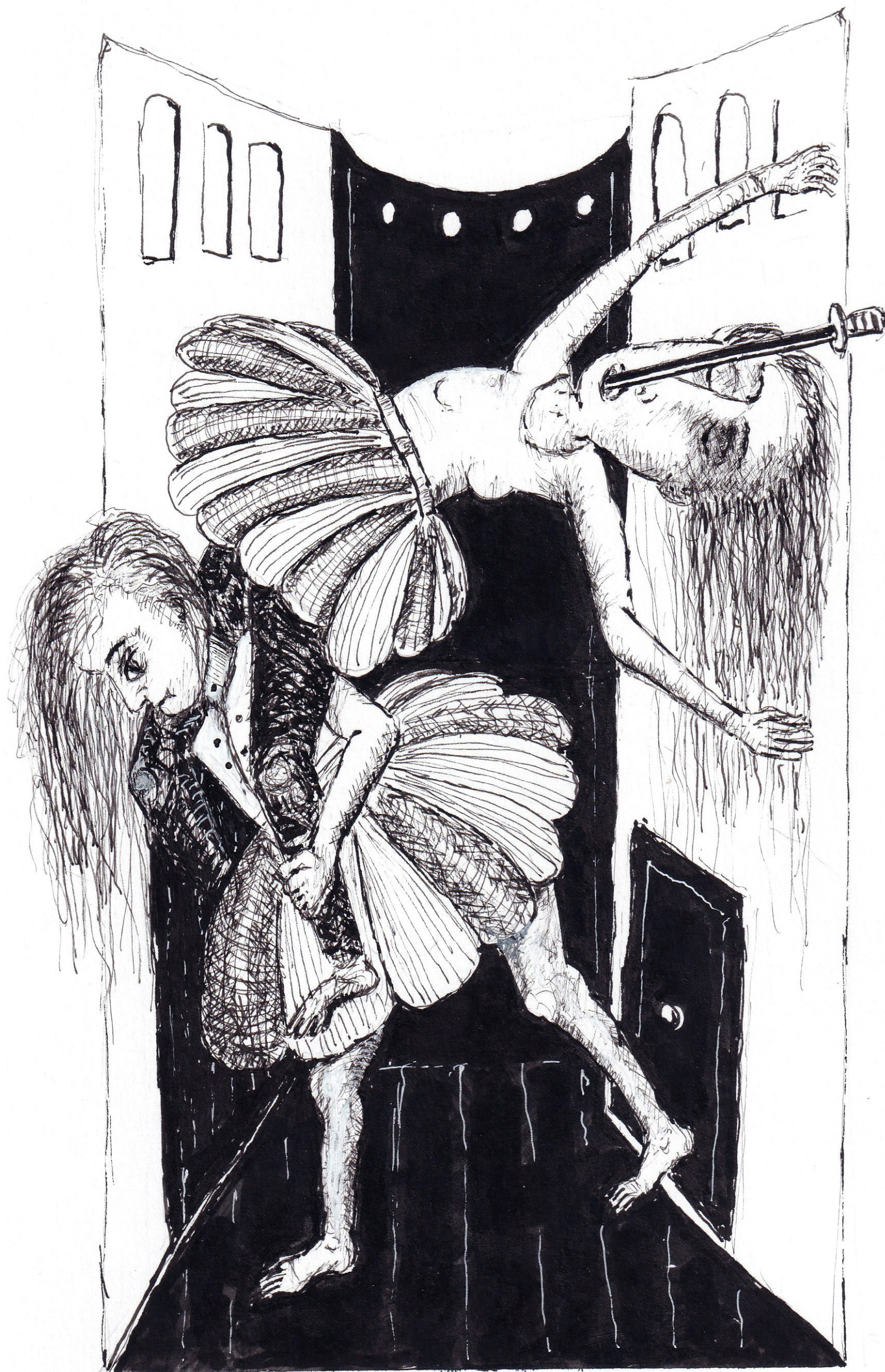
No.0326-B Sword-Swallower 2026 Ink on Bristol 9 × 12 in (22.9 × 30.5 cm)