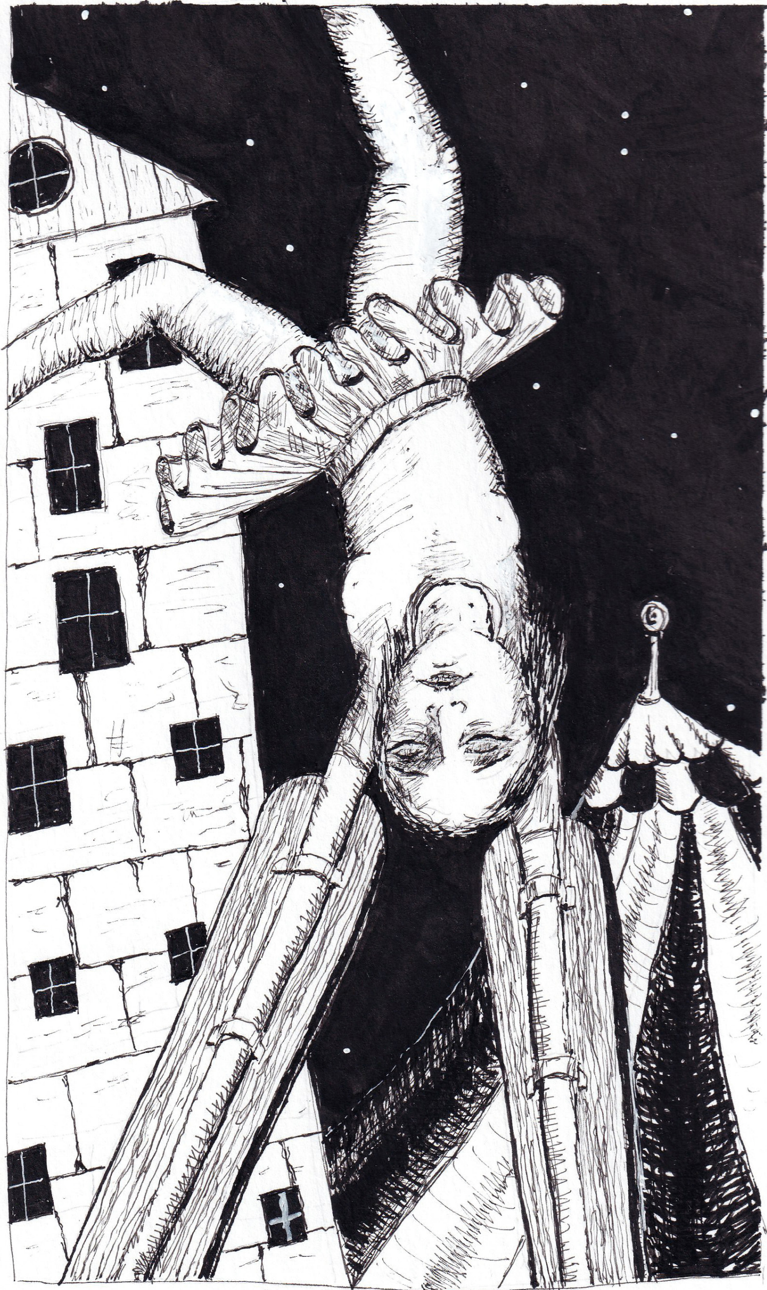
No.0426-C Falling 2026 Ink on Bristol 9 x 12 in (22.9 x 30.5 cm)