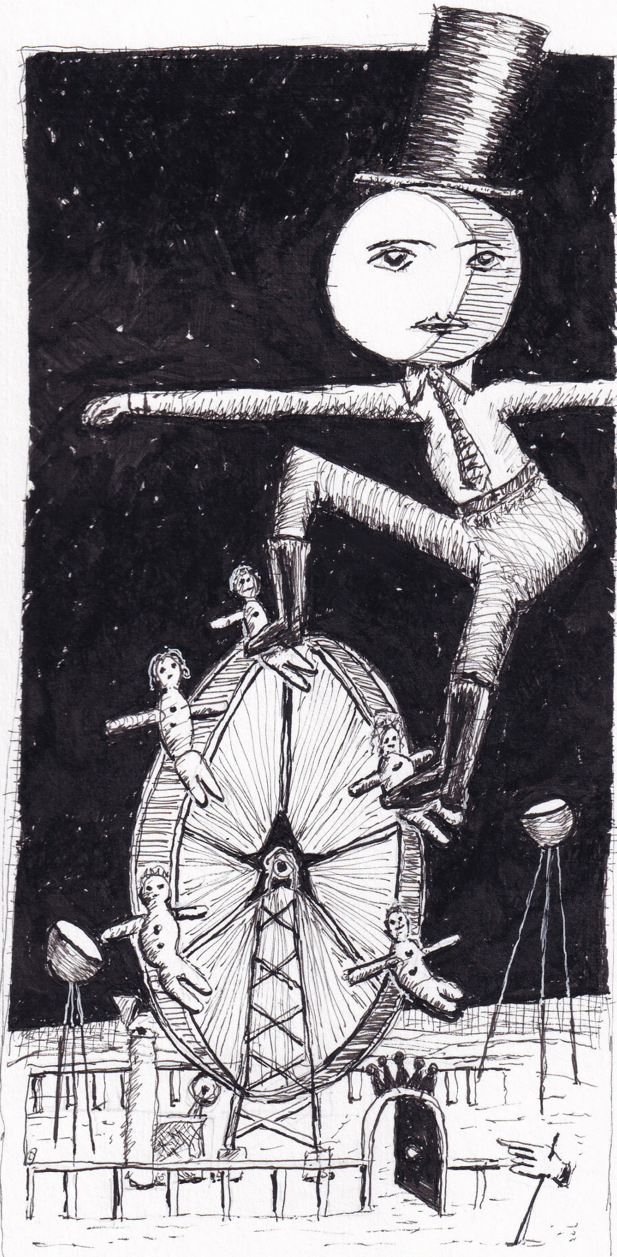
No.0126-C Ferris Wheel 2026 Ink on Bristol 9 × 12 in (22.9 × 30.5 cm)