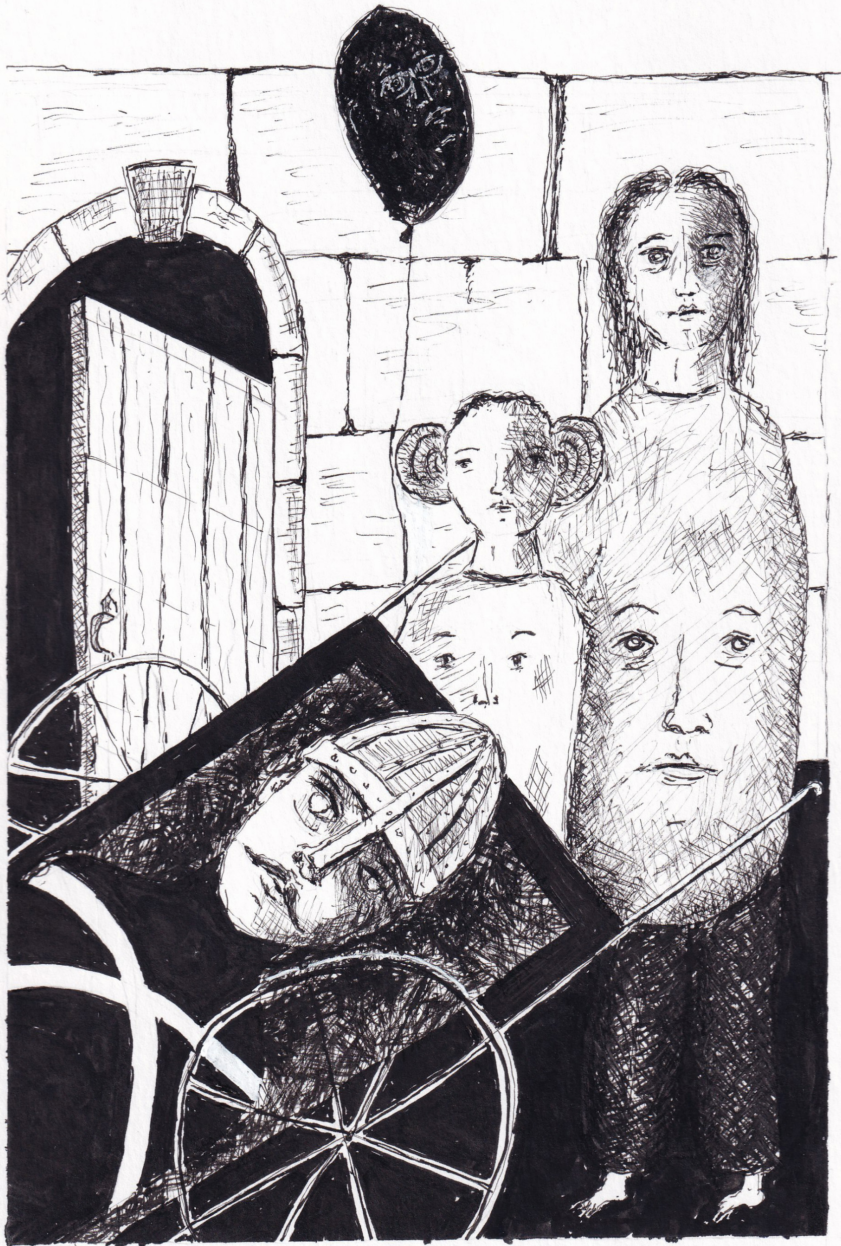
No.0226-B Handcart 2026 Ink on Bristol 9 × 12 in (22.9 × 30.5 cm)