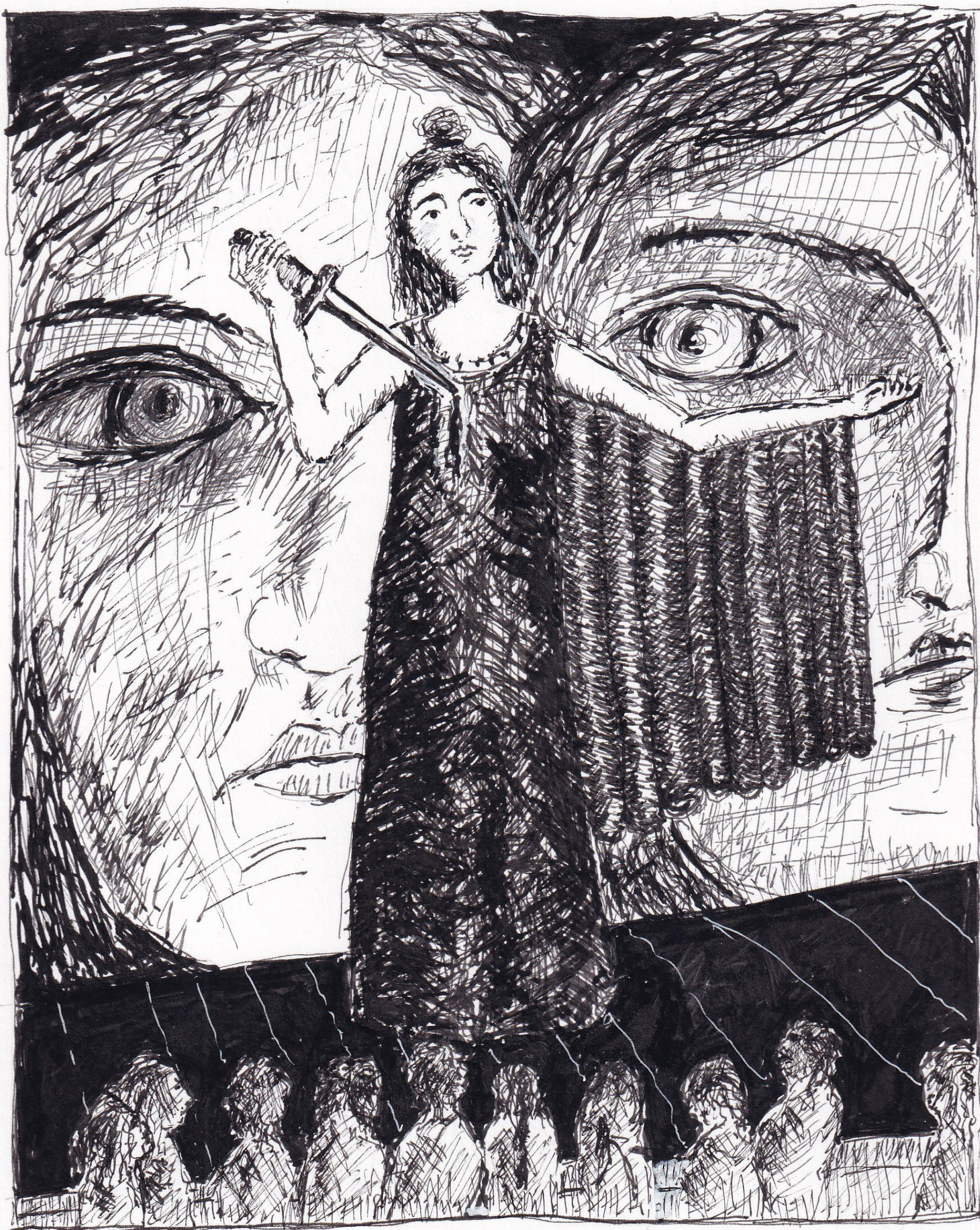
No.1225-A Opera 2025 Ink on Bristol 9 × 12 in (22.9 × 30.5 cm)